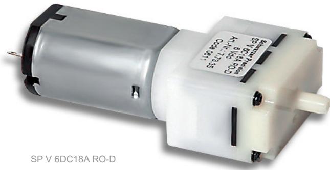
SP V 6DC18A RO-D