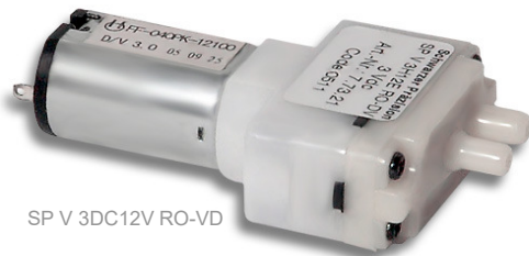
SP V 3DC12V RO-VD