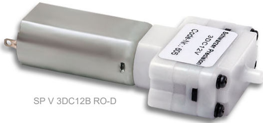
SP V 3DC12B RO-D